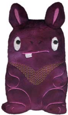
12399-13 Stitch 'n' Turn Monster 2 4.32 X 6.76 in. 109.73 X 171.70 mm 7,594 St. L

Note: Some designs in this collection may have been created using unique special stitches and/or techniques. To preserve design integrity when rescaling or rotating designs in your software, always rescale or rotate designs using the handles directly on-screen.