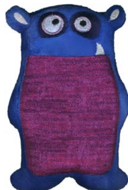
12399-11 Stitch 'n' Turn Pocket Monster 4.85 X 6.86 in. 123.19 X 174.24 mm 7,006 St. L