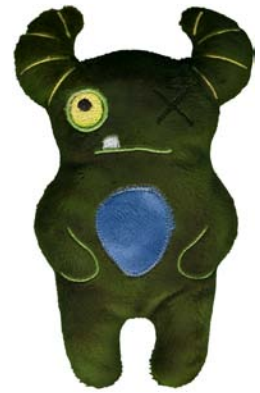
12399-16 Stitch 'n' Turn Monster 5 4.55 X 6.88 in. 115.57 X 174.75 mm 5,168 St. L