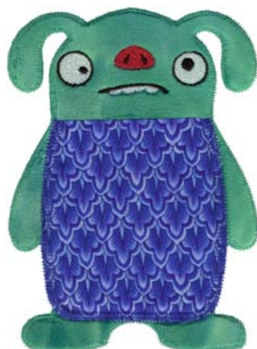
12399-10 Pocket Monster Appliqué 4.92 X 6.81 in. 124.97 X 172.97 mm 6,620 St. L