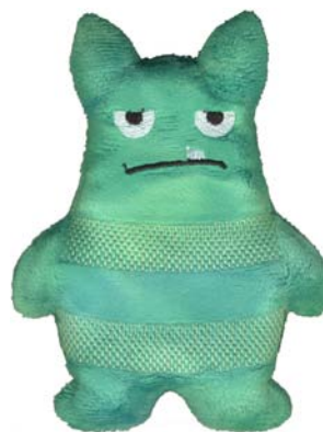
12399-23 Stitch 'n' Turn Monster 12 4.90 X 6.37 in. 124.46 X 161.80 mm 4,422 St. L