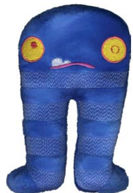
12399-24 Stitch 'n' Turn Monster 13 4.75 X 6.78 in. 120.65 X 172.21 mm 7,383 St. L

L Design contains a loose fill. S Some white areas shown are not stitched.