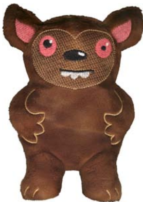
12399-17 Stitch 'n' Turn Monster 6 4.76 X 6.58 in. 120.90 X 167.13 mm 7,818 St. L