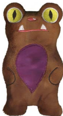
12399-22 Stitch 'n' Turn Monster 11 4.17 X 6.90 in. 105.92 X 175.26 mm 6,895 St. L