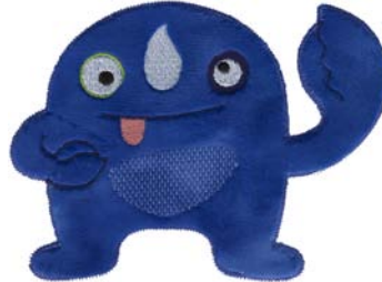
12399-03 Monster Appliqué 3 4.79 X 6.41 in. 121.67 X 162.81 mm 7,216 St. ⌘ L