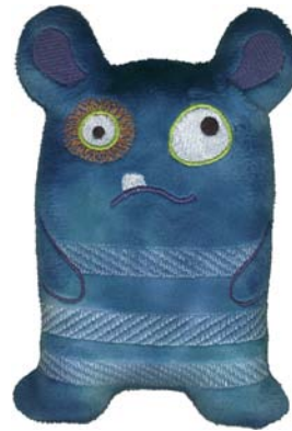
12399-15 Stitch 'n' Turn Monster 4 4.45 X 6.37 in. 113.03 X 161.80 mm 8,181 St. L