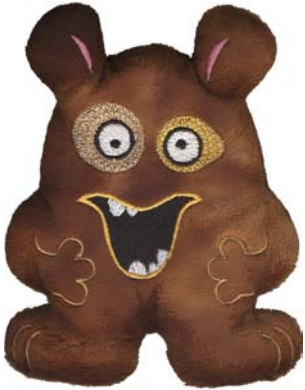
12399-25 Stitch 'n' Turn Monster 14

Note: Some designs in this collection may have been created using unique special stitches and/or techniques. To preserve design integrity when rescaling or rotating designs in your software, always rescale or rotate designs using the handles directly on-screen.