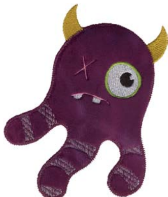
12399-05 Monster Appliqué 5 4.75 X 5.71 in. 120.65 X 145.03 mm 6,352 St. ⌘ L