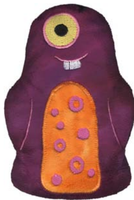
12399-18 Stitch 'n' Turn Monster 7 4.59 X 6.59 in. 116.59 X 167.39 mm 7,282 St. L