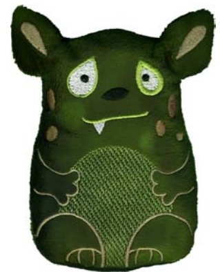
12399-20 Stitch 'n' Turn Monster 9 4.83 X 5.67 in. 122.68 X 144.02 mm 9,269 St. L