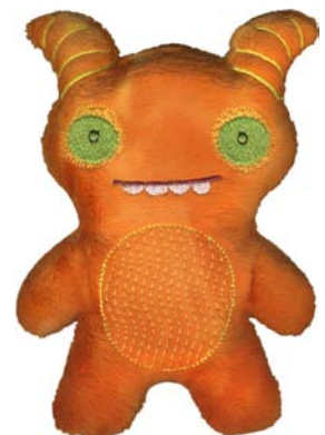
12399-12 Stitch 'n' Turn Monster 1 4.65 X 5.93 in. 118.11 X 150.62 mm 5,784 St. ⌘ L

⌘ Design contains a loose fill. ⚙ Some white areas shown are not stitched.