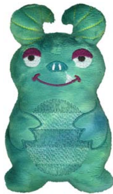
12399-14 Stitch 'n' Turn Monster 3 3.96 X 6.71 in. 100.58 X 170.43 mm 7,671 St. L