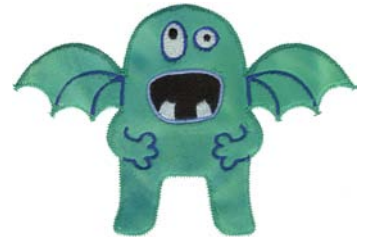
12399-08 Monster Appliqué 8 4.68 X 6.85 in. 118.87 X 173.99 mm 8,815 St. L