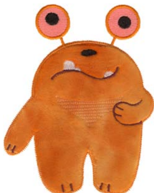
12399-09 Monster Appliqué 9 4.89 X 6.22 in. 124.21 X 157.99 mm 8,086 St. L