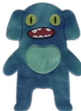
12399-07 Monster Appliqué 7 4.86 X 6.63 in. 123.44 X 168.40 mm 7,643 St. L