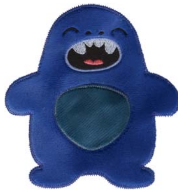
12399-06 Monster Appliqué 6 4.95 X 5.28 in. 125.73 X 134.11 mm 5,271 St. L