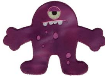
12399-02 Monster Appliqué 2 4.85 X 6.63 in. 123.19 X 168.40 mm 5,502 St. L