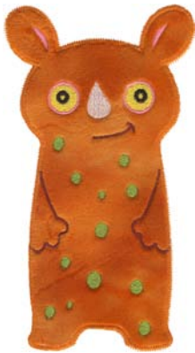
12399-01 Monster Appliqué 1 3.68 X 6.71 in. 93.47 X 170.43 mm 6,647 St. L

Note: Some designs in this collection may have been created using unique special stitches and/or techniques. To preserve design integrity when rescaling or rotating designs in your software, always rescale or rotate designs using the handles directly on-screen.