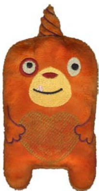
12399-21 Stitch 'n' Turn Monster 10 3.65 X 6.74 in. 92.71 X 171.20 mm 7,747 St. L