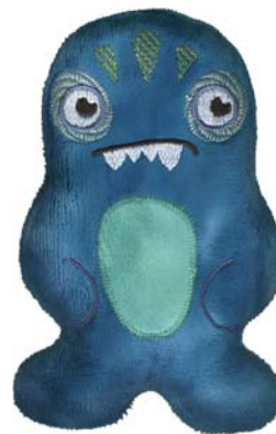
12399-19 Stitch 'n' Turn Monster 8 4.46 X 6.34 in. 113.28 X 161.04 mm 6,576 St. L