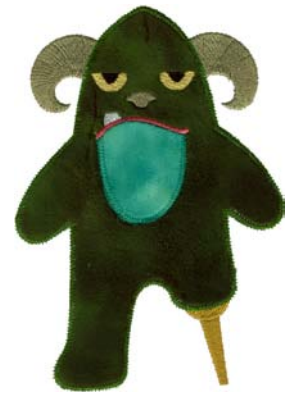
12399-04 Monster Appliqué 4 4.54 X 6.55 in. 115.32 X 166.37 mm 7,538 St. L